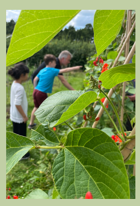
Picking at Oakenclough

This is the first annual report from Transition Wilmslow as a Charitable Incorporated Organisation, being registered as such in 2023, with our first official trustees meeting taking place in January. We have been working to ensure that we have the right policies and liaison in place with our very active groups.