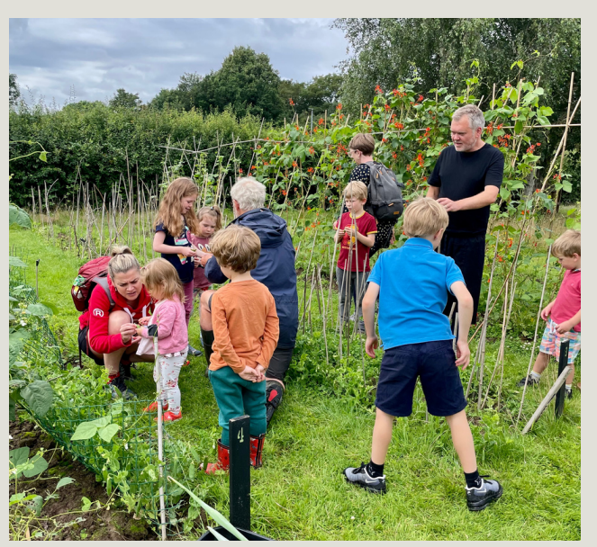
Picking Food for Plot to Plate Sessions at Oakenclough