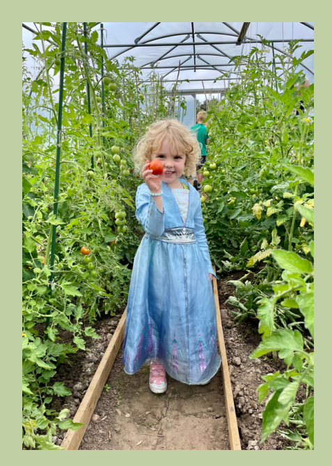
Finding ingredients for Plot to Plate